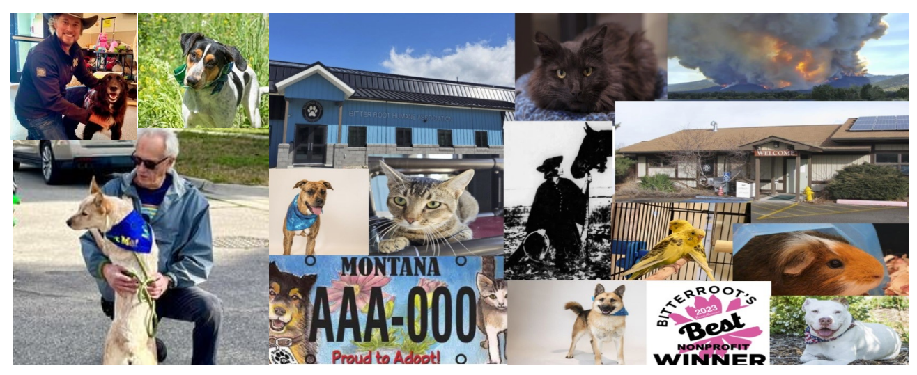
Shelter Hours: Mon CLOSED; Tues - Fri 1 pm-6 pm; Sat & Sun - noon to 5 pm

If emails don't make your tail wag you can <u>Unsubscribe</u> at any time. Sign up today so you don't miss out on any shelter news. This will be the final paper newsletter moving forward emails will be sent to you!